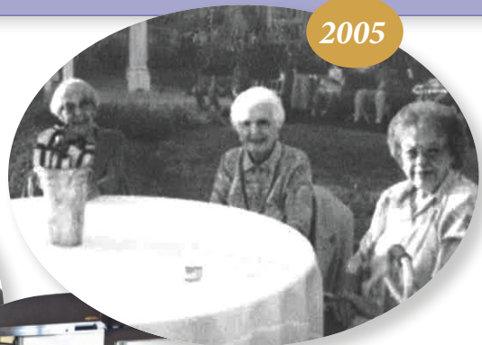
Residents and guests at Valley's "Sweet Sixteen" anniversary bash, September 15, 2005.