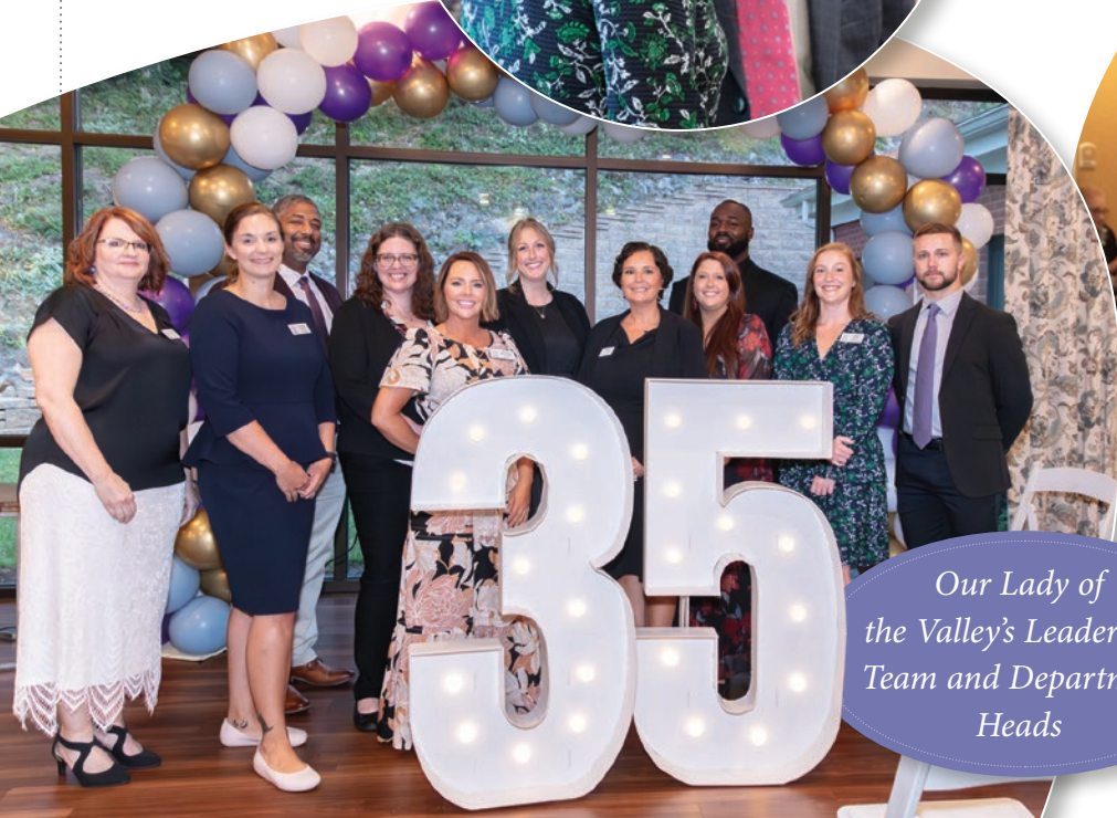
Our Lady of the Valley's Leadership Team and Department Heads